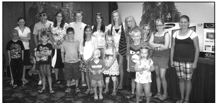
THE 2011 MCRA FAIRMONT FAMILY BAR-B-CUE DINNER WE HOPE EVERYONE JOINS US THIS YEAR!

Saturday will start with the MCRA Business Breakfast meeting and the day will end with a Family Fun Bar-B-Cue Dinner. Great Food - Games - Door Prizes