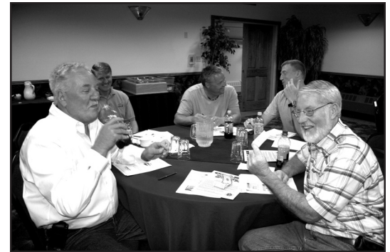
This inter-active seminar was fun and productive!