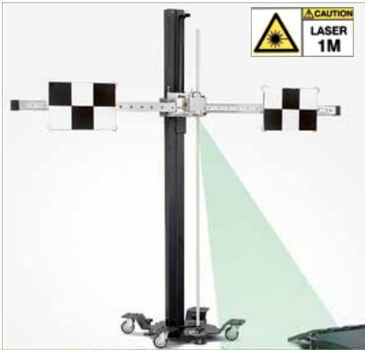
Universally applicable thanks to robust trolley and height adjustable beam

Finally—an easy-to-use and precise system that allows for target based recalibrations on the most popular vehicle ADAS systems. Now you can complete target calibration work in-house!