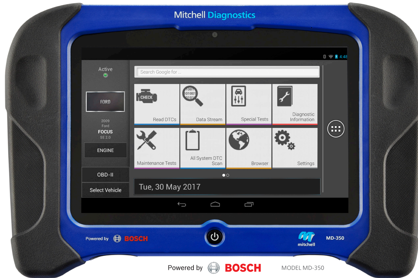
Powered by BOSCH MODEL MD-350

When you connect Mitchell Diagnostics™ into your repair and claims infrastructure, you can quickly access the data needed to ensure a safe and proper repair.